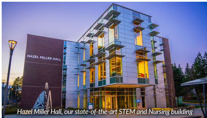
Hazel Miller Hall, our state-of-the-art STEM and Nursing building

Scan this QR code access our website, campus tour, testimonials, resources, and more.