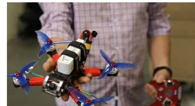
Build a drone in "Winged Unmanned Aircraft Design."