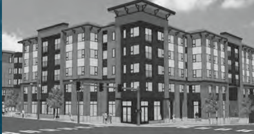
Triton Court Residence Hall