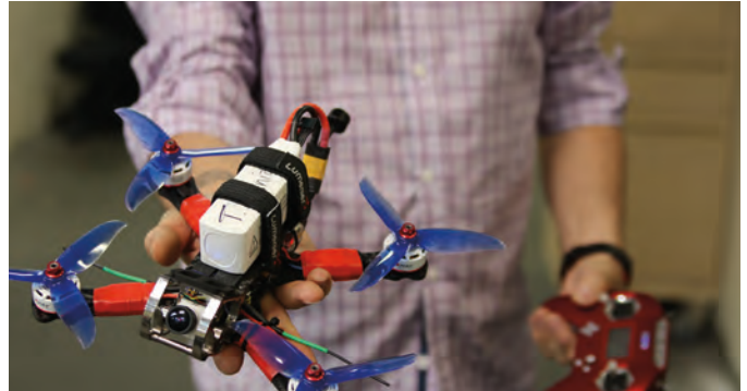
Build a drone in "Winged Unmanned Aircraft Design."